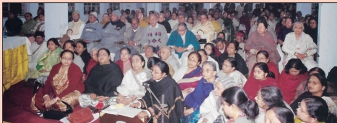
Monthly Kathamrita discourse in progress