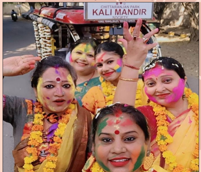
The Tolo for the service of the Bhaktas. A CSR initiative