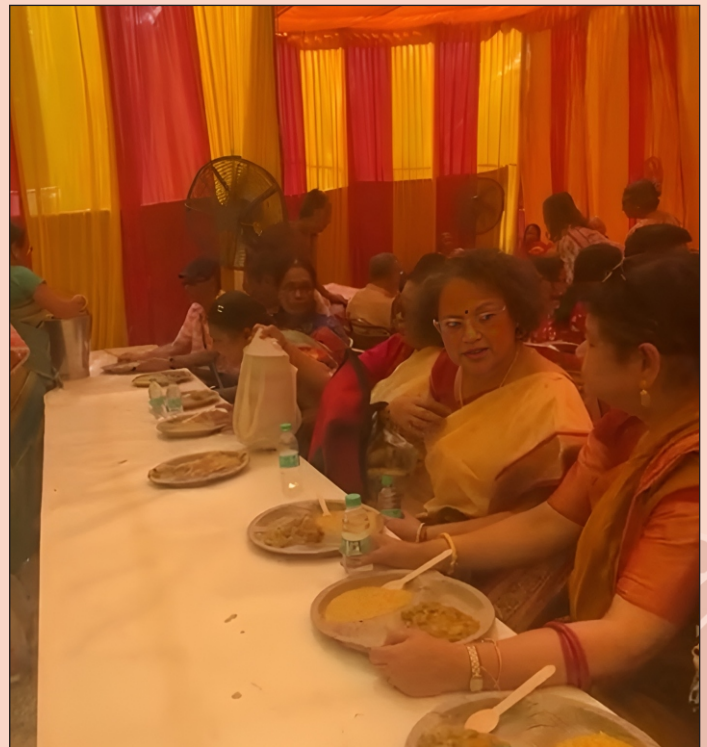
Senior citizens partaking the Bhog of Ma Annapurna