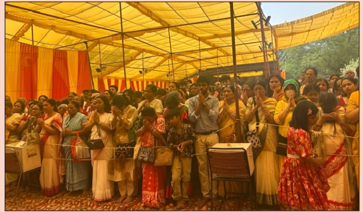
Bhaktas offering Anjali during Ma Annapurna Puja