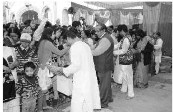
'Holy Bhog Distribution' on Saraswaty Puja