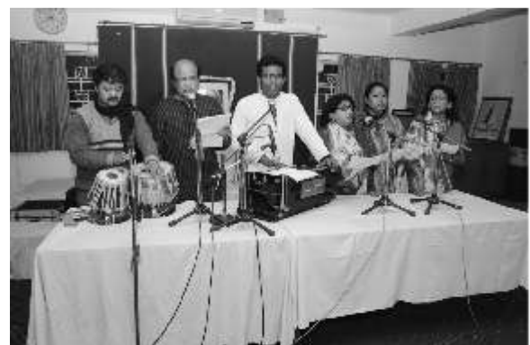
Artists of 'Jhankar' Group on Netaji's Birthday