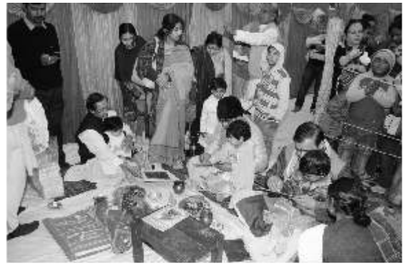
'Hathey Khari' on Saraswaty Puja